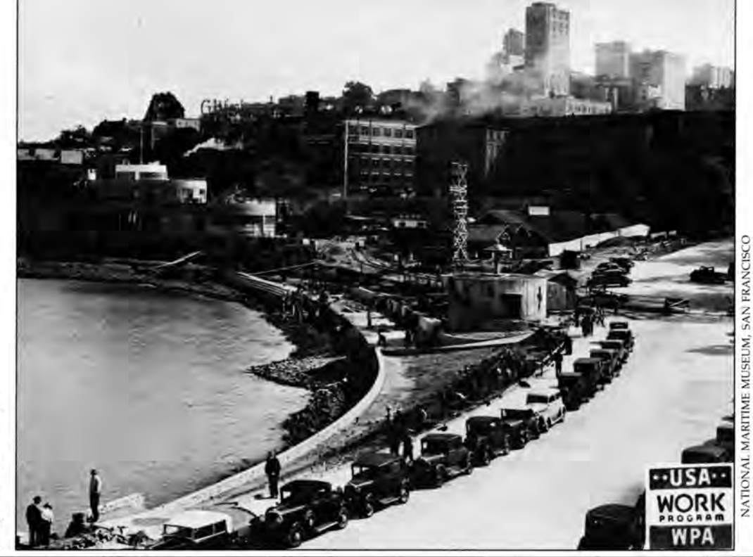
Aquatic Park under construction in March, 1938. The shoreline extends into the Bay, and the relocated railroad track is visible just inland from the bathhouse construction.

(Far right) Aquatic Park on Dedication Day, 1939.