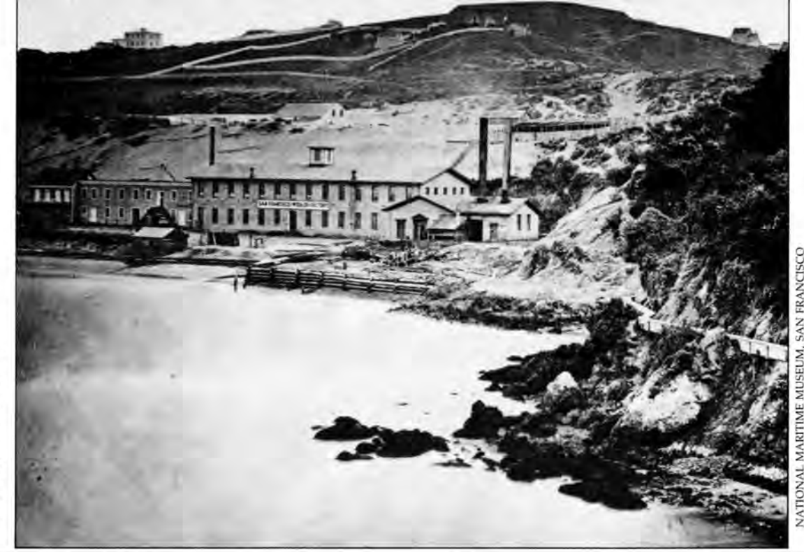
Black Point Cove in the 1860s. The sluice visible in the foreground carried water to the San Francisco Water Company's pumping station to the right of the woolen mill. Smallscale filling to even out the jagged shoreline is visible in front of the mill.

ers, "by this means a large new waterfront area of desirable flat land has been made more available for factory and other commercial uses." he destruction of