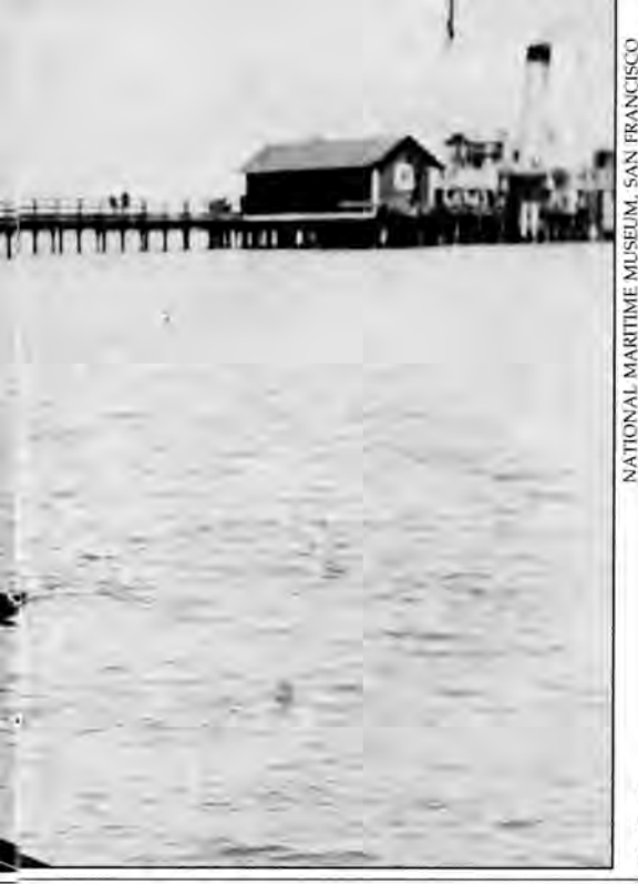
The Dolphin Club's junior crew, winners of the Bay Area rowing championship on April 16, 1916.

for swimming, boating or fishing" and called for the cessation of development at the site. It did not call for the reversal of damage already done: